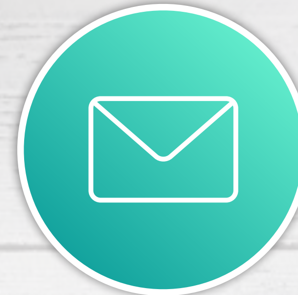
Thank You Cards