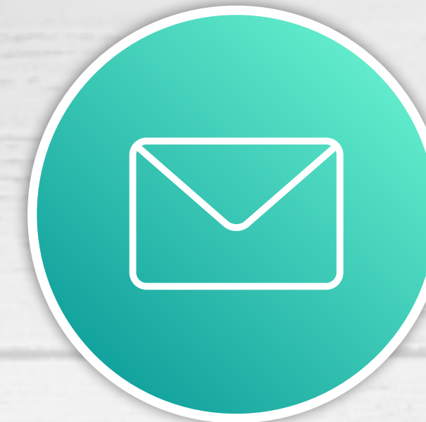
Thank You Cards